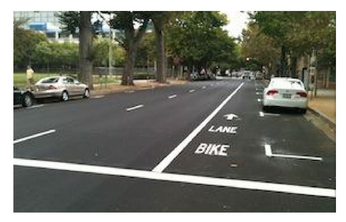
Road Diet (Including On Street Parking and Bike Lanes)

Additionally, the new road markings can serve as a warning sign; because these pavement patterns are mostly unfamiliar to road users, they violate driver expectancy causing motorists to decelerate.