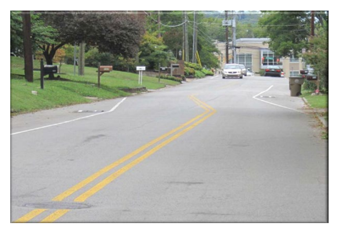
Lateral Shift - With Road Paint